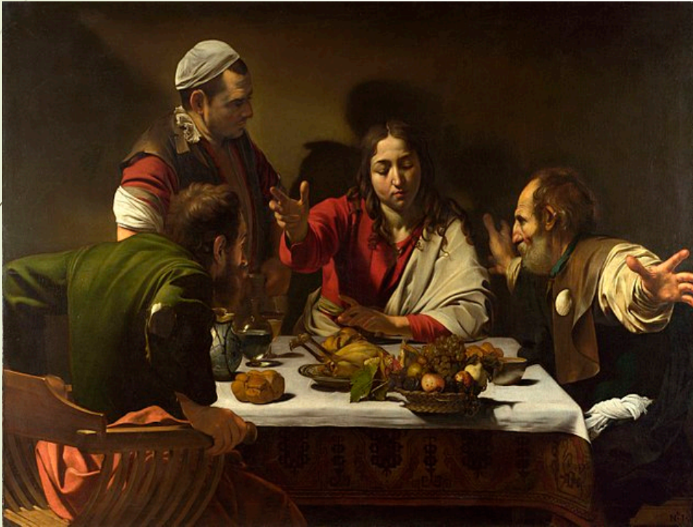
Supper at Emmaus by Caravaggio