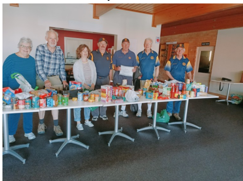
Blackwood Rotary Club members & donations

Blackwood Rotary Club has been a wonderful contributor to Beacon's work over many years.