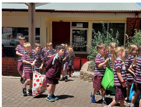
St John's Receptions with donations